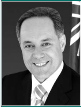
The Hon. M Iemma, MP, Premier, Minister for State Development and Minister for Citizenship