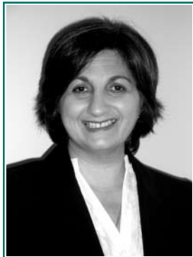
The Hon B Perry MP, Minister for Juvenile Justice, Minister for Western Sydney and Minister Assisting the Premier on Citizenship