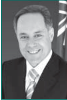
The Hon. M. Iemma, MP Premier, Treasurer and Minister for Citizenship