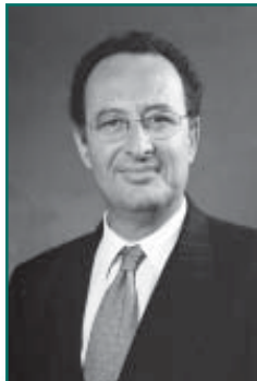
The Hon. M. Orkopoulos, MP Minister for Aboriginal Affairs and Minister Assisting the Premier on Citizenship