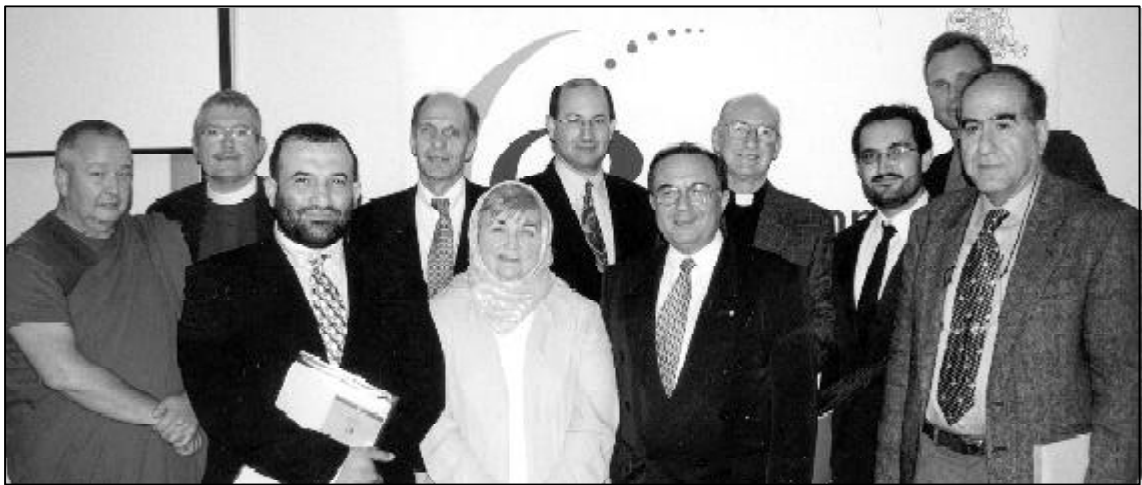
Participants in Islam in a Multifaith Australia